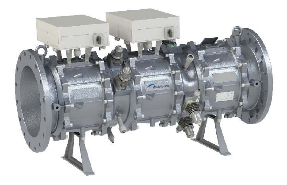
Figure 3: Hydro-Optic™ (HOD) UV system offers improved efficiency for organic reduction with superior monitoring capabilities over other AOP technologies to ensure compliance.

Atlantium's HOD UV systems (Figure 3) monitor each MP lamp individually to make sure that — "what you see is what you get". As UVT and lamp output are measured separately, the HOD UV system automatically adjusts lamp power when conditions fluctuate so that the minimum required dose set by the user is guaranteed to be delivered.